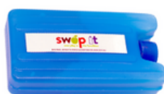
Frozen ice brick