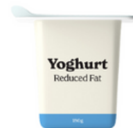
Frozen reduced fat yoghurt tub