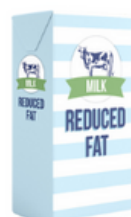
Frozen plain milk popper