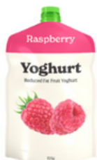
Frozen reduced fat yoghurt pouch