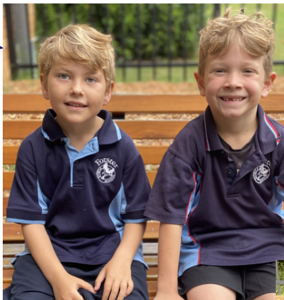
Otis & Hudson