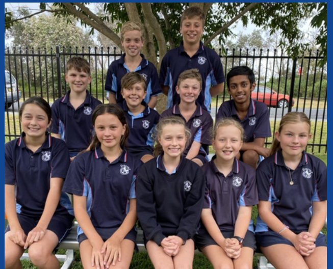
2023 Leadership Team