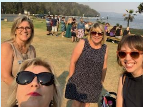
This is me with my colleagues taking the selfie

Over the many years, advances in Education have been made. Class sizes have become smaller, technology has moved ahead and nearly all Kindergarten students have attended preschool. The start of a child's education, however, begins with their family or carer.