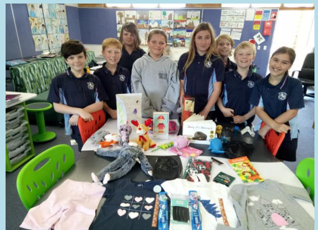
Some of the children in 5/1 who took part in 'Operation Christmas Child' with some of their gifts.