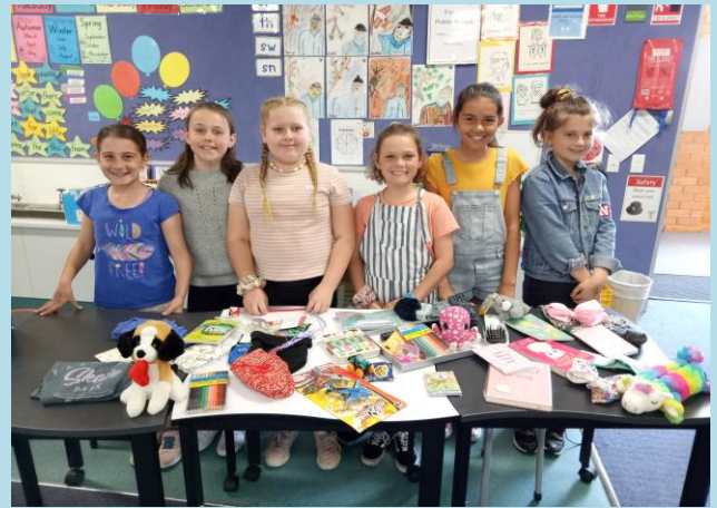
Some of the children in 4/5 -11 who took part in 'Operation Christmas Child' with some of their gifts.